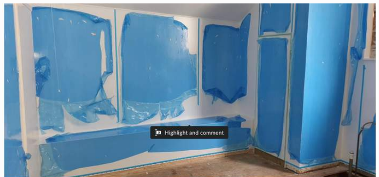
New wall panels still with protective covers on